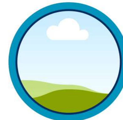
TBC TBC TBC