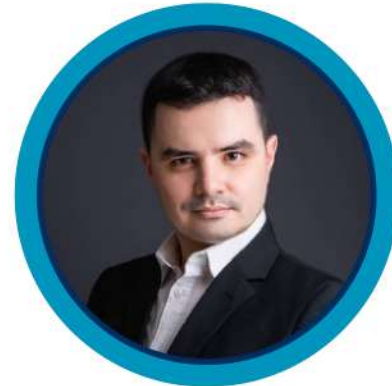
PR Dexter Yeh Publications