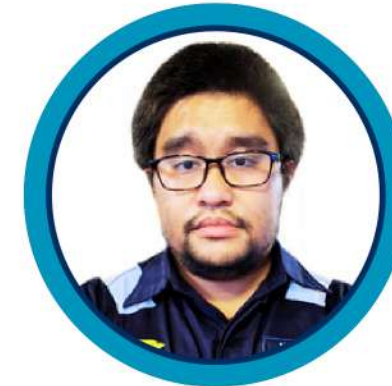
Strategy Nazil Lan Agriculture